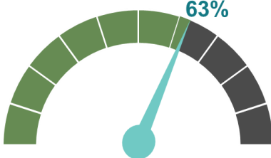
PSE clean electricity portfolio forecast by end of 2025*