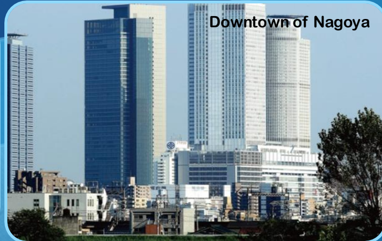
Downtown of Nagoya

The participants conduct independent research as visiting scholars. The primary purpose is to have the students gain research experience, knowledge, and skills at the visiting university, but we also expect them to be driven, flexible, cooperative, and tough in multi-cultural environment. Selected students will stay at Nagoya University for about 10 weeks, as well Nagoya students do in partner universities. Scholarship will be awarded to qualified students.