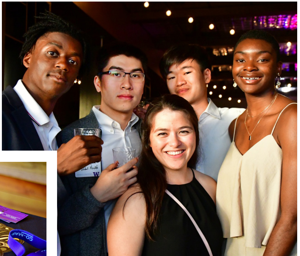
NOTE: Images from events in 2019, pre-COVID-19.

If you are interested in making a commitment to increasing diversity within the graduate student pipeline, whether by becoming an OG or by requesting an OG for your department, please contact gomap@uw.edu .